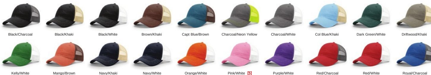
Black/Charcoal Black/Khaki Black/White Brown/Khaki Capt Blue/Brown Charcoal/Neon Yellow Charcoal/White Col Blue/Khaki Dark Green/White Driftwood/Khaki Kelly/White Mango/Brown Navy/Khaki Navy/White Orange/White Pink/White [S] Purple/White Red/Charcoal Red/White Royal/Charcoal Royal/White Texas Orange/Khaki

SPLIT COLORS: First color is crown front panels, eyelets, visor, undervisor, and button. Second color is crown back mesh panels, backstrap, and contrast stitching on crown front panels and visor.