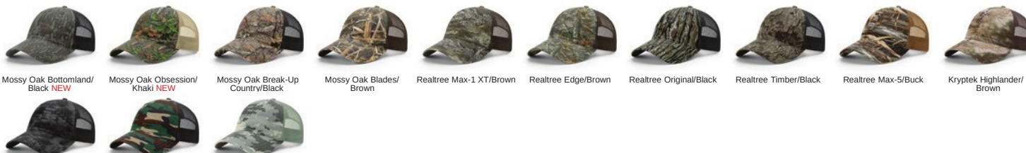
Mossy Oak Bottomland/Black NEW Mossy Oak Obsession/Khaki NEW Mossy Oak Break-Up Country/Black Mossy Oak Blades/Brown Realtree Max-1 XT/Brown Realtree Edge/Brown Realtree Original/Black Realtree Timber/Black Realtree Max-5/Buck Kryptek Highlander/Brown Kryptek Typhon/Black Green Camo/Black Digital Camo/Light Green

COLORS: First color is crown and visor camo, button, and eyelets. Second color is crown, crown back mesh panels and contrast stitching.